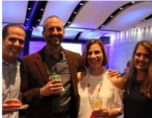
Parents enjoy the AGS Auction 2017 at the Georgia Aquarium.