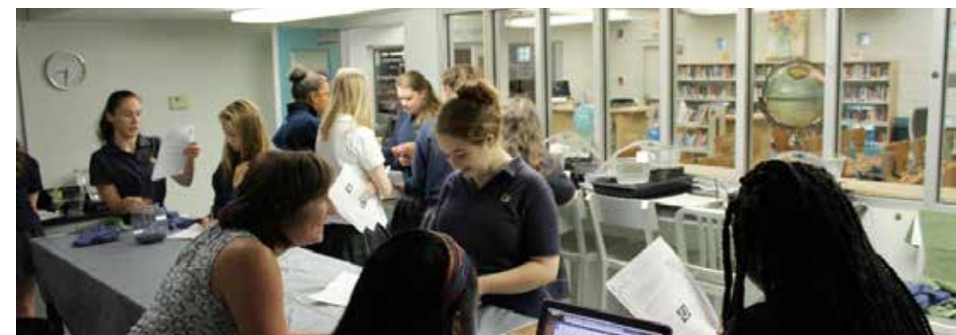
Students enjoy the newly renovated Horizon Center spaces.