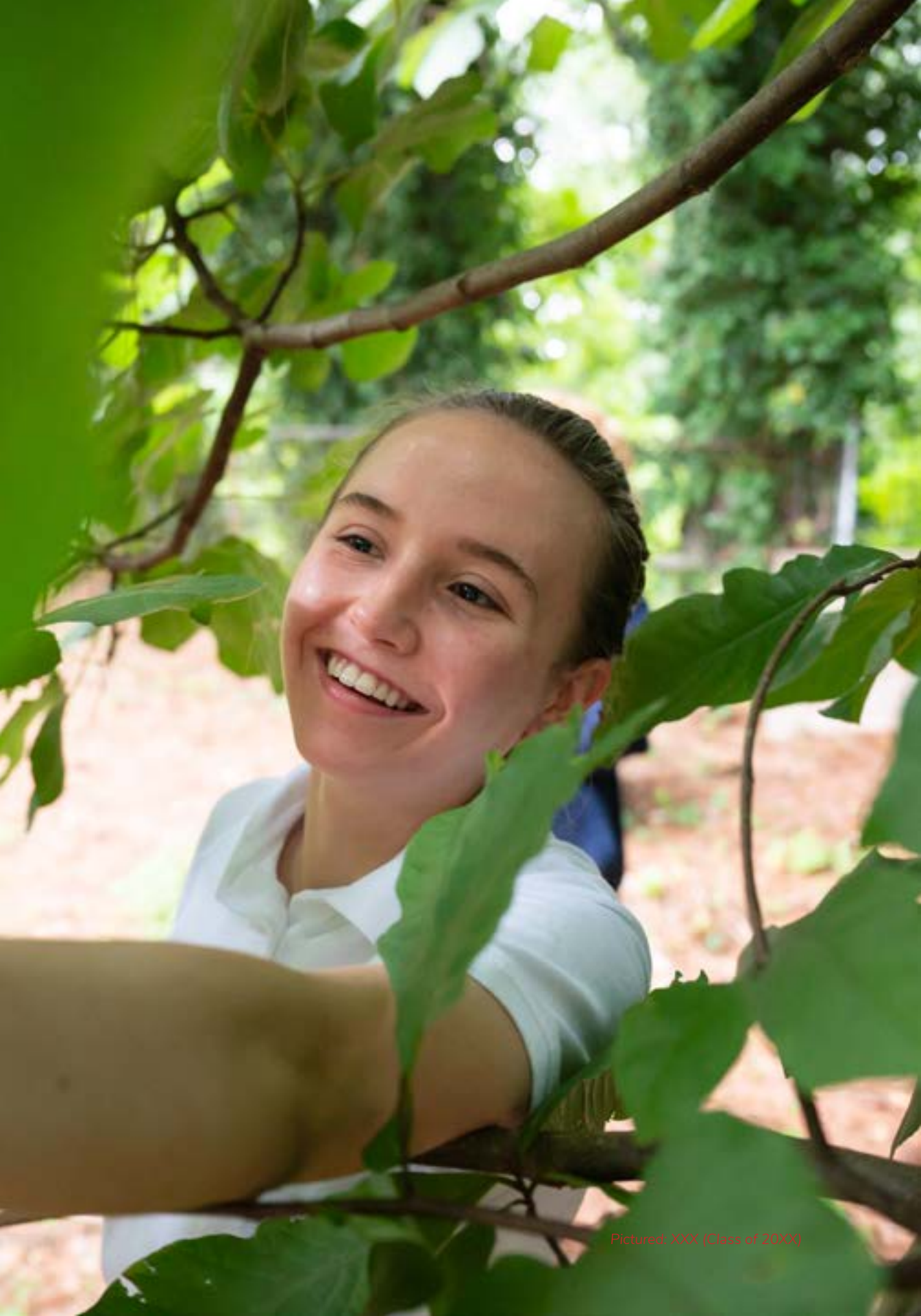
Pictured: XXX (Class of 20XX)