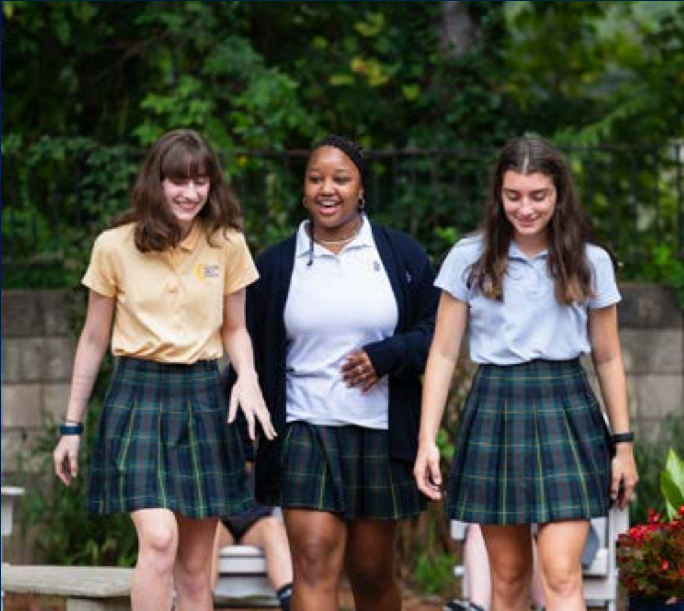
Pictured above: XXXXX (Class of 20XX)